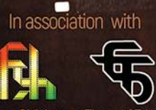
Films Division Govt. of India